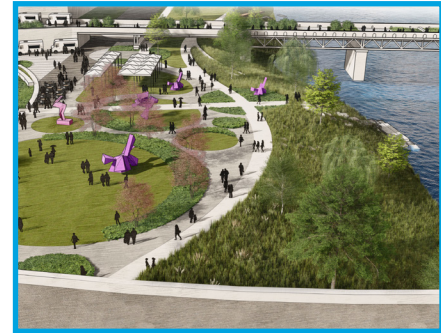
Shakopee Riverbank Stabilization