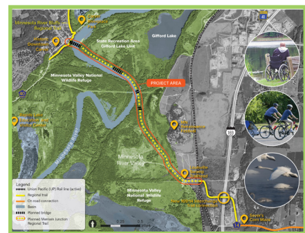
Merriam Junction Trail