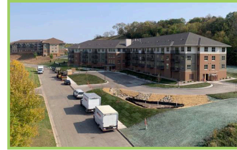
Housing Development in Scott County