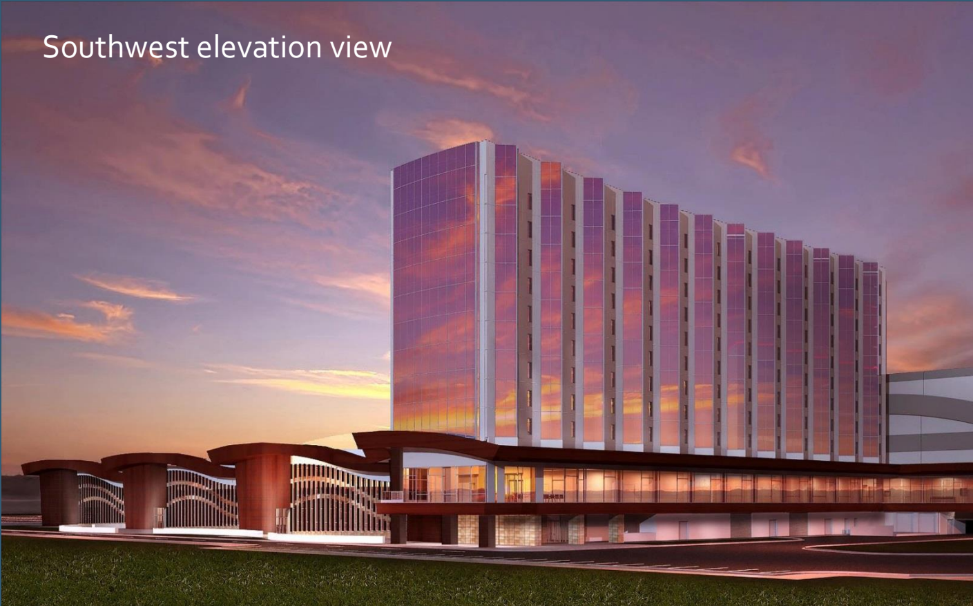
Southwest elevation view